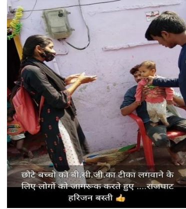
छोटे बच्चों को वी.सी.जी. का टीका लगवाने के लिए लोगों को जामरुक करते हुए ....सजघाट हरिजन बस्ती 🙌