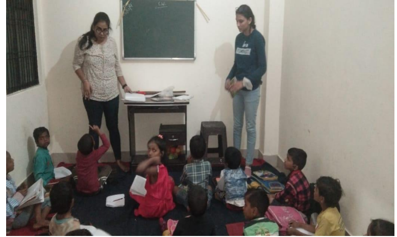
Students as intern in Umeed Ki Kiran Foundation