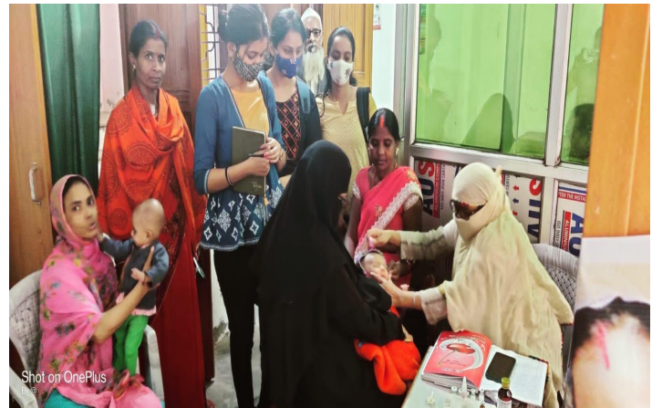
Shot on OnePlus